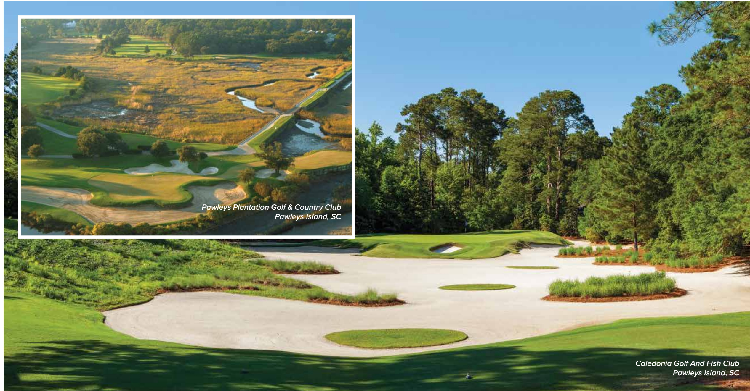
Pawleys Plantation Golf & Country Club Pawleys Island, SC